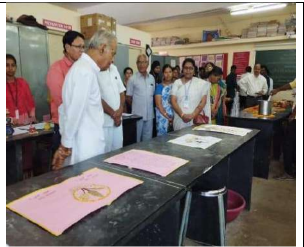
Demonstrations of Millets