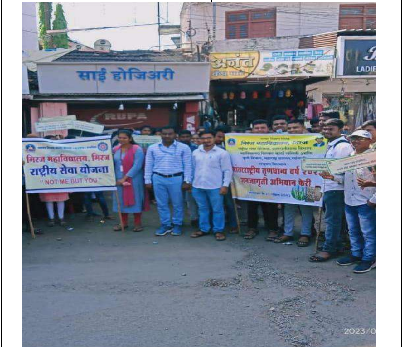
Rally on International Year of Millets in Miraj City