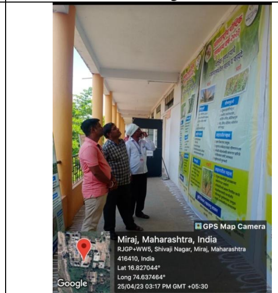
Posters on Millets