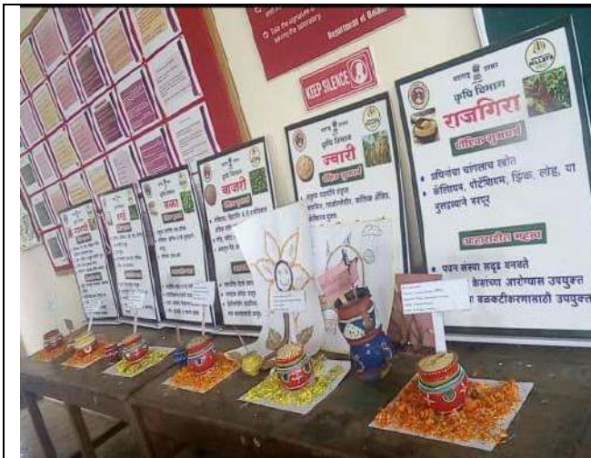
Posters on Millets