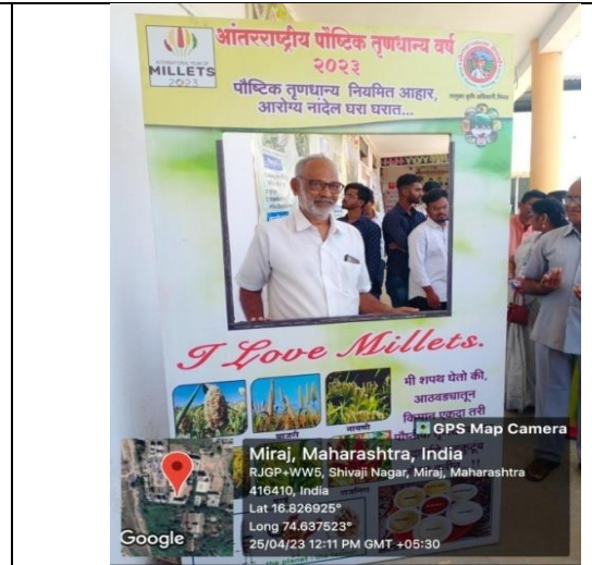
Hon. Director YSS Sangli