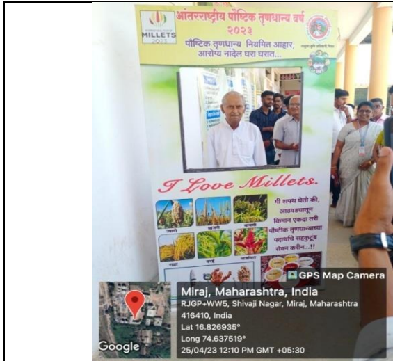
Hon. Chairman, YSS Sangli