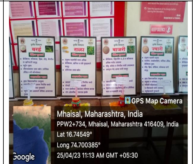
Posters on Millets