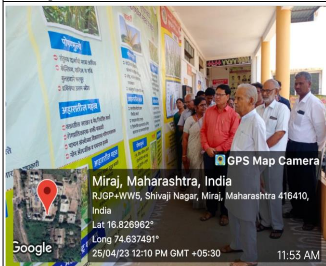
Posters on Millets